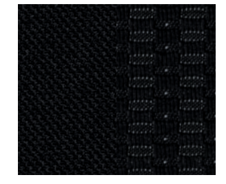
Graphite Cloth Sport