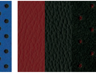
Graphite Red Leather / Alcantara® with Red Accents8 NISMO

Blue Leather / Synthetic Suede<sup>8</sup> Performance